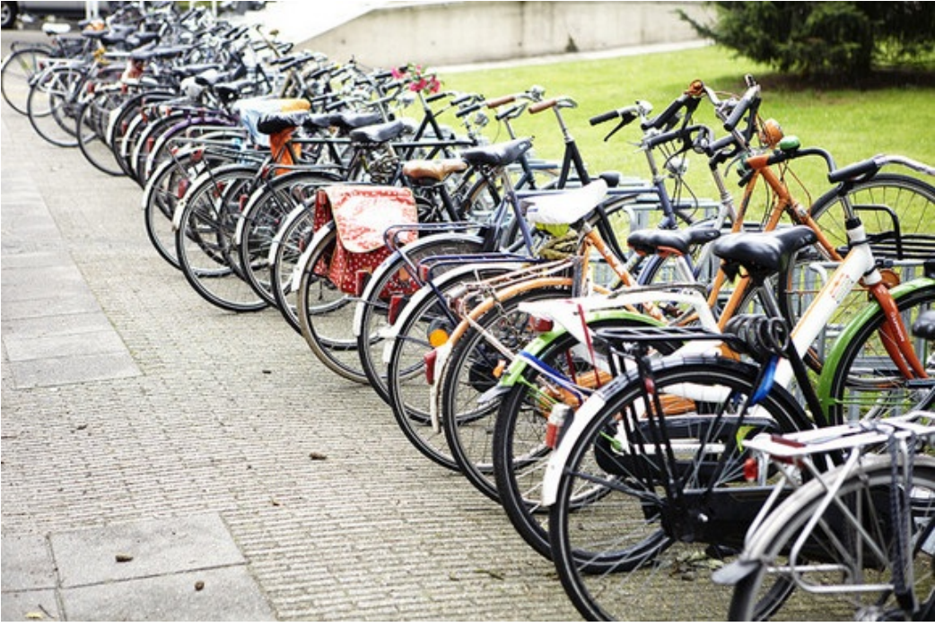
Bikes parked at the Tilburg University campus

Research Universities offer the highest level of education available in the Netherlands. Education at a Research University is more theoretical and at an academic level, aimed at developing critical thinking skills, preparing students for either a professional or academic career. Universities of Applied Sciences ( HBO ) offer more practice-oriented education which prepares students for specific professions (e.g., physiotherapist, primary-school teacher, or hospitality manager).