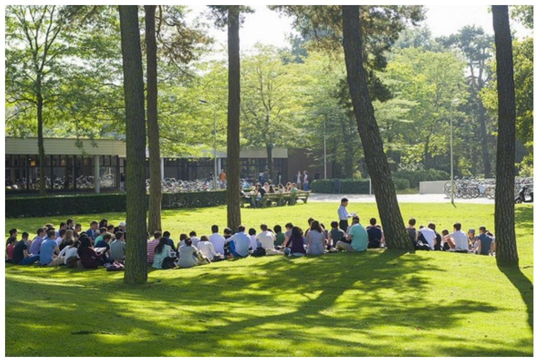
Lecture in the open air on a summer day

Tilburg University has a green campus and is located on the edge of a park-like forest. The campus itself is bustling with student activity, a contrast that makes Tilburg University a truly attractive and dynamic place for learning. Tilburg University has a modern University Library and excellent Sports Center, which are all within easy walking distance from each other. Student work spaces in every building are equipped with all the modern facilities you need to make studying on campus a pleasant experience. Organizations aimed specifically at international students organize all kinds of social activities. All ingredients are there to give you a stimulating, inspiring, and joyful campus experience.